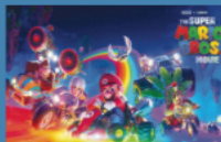
The Super Mario Bros. Movie July 19, 2024

Activities begin at 7:30 p.m. Doors open at 8:00 p.m. Movies will be shown at approximately 8:30 p.m.