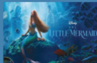
The Little Mermaid June 21, 2024

At the Grafton Family Aquatic Center 649 N. Green Bay Road