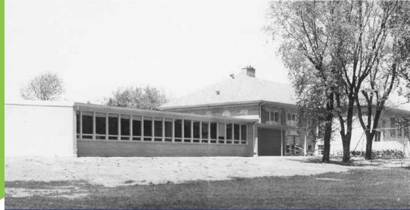
L to R: the 1955, 1908, and 1951 school buildings still in use today

“We have an opportunity to extend our ministry for future generations. We need to be mindful of the needs that will allow us to bring our mission to life for years to come.” — current church member