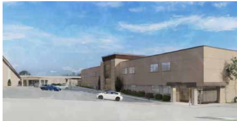
a conceptual architectural rendering